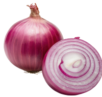
b. egg / onion