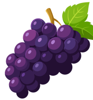
c. grapes / bread