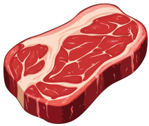
a. meat / wine