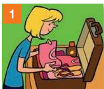
1 going away

getting back getting on going away going out picking up taking off